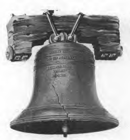
Join Payroll Savings NOW!

The first annual engineer's ball, which was held at the El Fidel Hotel January 20 has been reported as a complete success. The ball was sponsored by eight of the American engineering societies and indications are that the ball may become a highlight in Albuquerque each year.